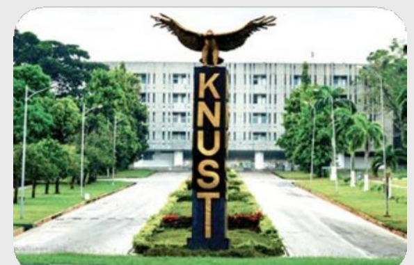
Kwame Nkrumah University of Science and Technology Founded in 1951, is a leader in science, engineering and tech education in Africa.