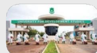
University for Development and Studies