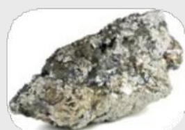
Manganese Fourth-largest producer ore