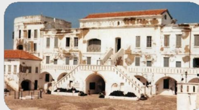
Cape Coast Castle UNESCO World Heritage Site, stands as a solemn reminder of the trans-Atlantic slave trade and the resilience of the African spirit.

Ghana is a beacon of tourism and heritage in Africa. Attractions include the Cape Coast and Elmina Castles, UNESCO World Heritage sites that echo the story of the trans-Atlantic slave trade; Kakum National Park with its famed canopy walkway; Mole National Park; and the Kwame Nkrumah Mausoleum. Festivals like Homowo, Damba, Kundum, Aboakyir, Odwira, and many others celebrate Ghana's rich traditions and communal spirit.