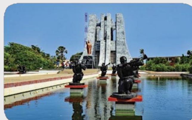
Kwame Nkrumah Mausoleum Dedicated to Ghana's first President and African liberation hero. The monument is both his final resting place and a celebration of freedom, unity and visionary leadership.