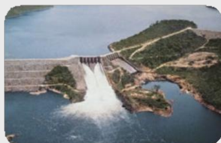
Volta Lake A cornerstone of Ghana's hydropower supply, inland transportation, fisheries, and industrial development, enabling regional electricity integration and economic growth.

From southern rainforests to northern savannahs, Ghana's beauty is unmatched. The spectacular Volta Lake, the largest man-made lake in the world, stands as a symbol of innovation and hydroelectric achievement. Ghana's 500-kilometer coastline offers beautiful beaches and historical forts and castles, reminders of its centuries-long interaction.