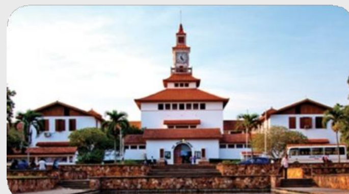
University of Ghana Founded in 1948, is the nation's oldest and largest university, renowned for excellence in the humanities, social sciences and health sciences.

Ghana is home to renowned universities, including the University of Ghana, Kwame Nkrumah University of Science and Technology, Ashesi University, Central University and the University of Cape Coast. The Country continues to produce scholars and scientists contributing globally on fields like medicine, engineering, law and space science.