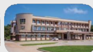
University of Energy and Natural Resources