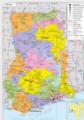
A Map of Ghana with Regions, Road Networks and Major Water Bodies. Map of Ghana with Regions, Road Networks and Major Water Bodies.

Situated along the Gulf of Guinea on the west coast of Africa, Ghana lies just a few degrees north of the Equator. The country shares borders with Côte d'Ivoire to the west, Burkina Faso to the north, Togo to the east, and the Atlantic Ocean to the south. Covering about 238,533 km 2 , Ghana is home to over 35.3 million people, known globally for their warmth, hospitality and rich cultural heritage.