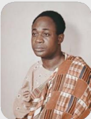
Osagyefo Dr. Kwame Nkrumah Pan-Africanist Ghana's first president

Their achievements embody Ghana's commitment to leadership, peace, innovation and intellectual excellence.