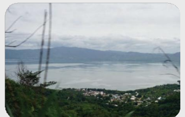
Lake Bosomtwe Ghana's only natural inland lake in the Ashanti Region. It is a sacred meteorite crater lake and popular tourist destination surrounded by lush mountains.