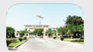
University of Education, Winneba