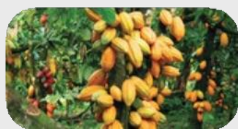
Cocoa Second largest producer of cocoa

Ghana was the sixth-largest producer of manganese in the world as of 2021. The production volume of the metal reached 5.1 million metric tonnes in 2024 and projected to reach 8 million tonnes in 2025.