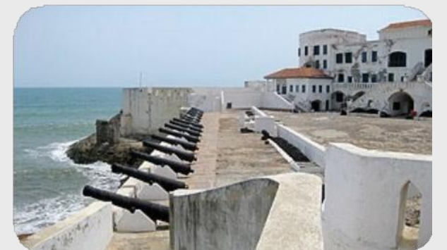
Elmina Castle UNESCO World Heritage Sites: symbols of Ghana's heritage and humanity's shared history.