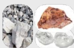
Ghana is rich in limestone, bauxite and diamond