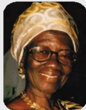
Esther Afua Ocloo Founding member of Women's World Banking, a global microfinance organization supporting women entrepreneurs.