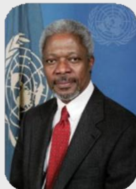
Kofi Annan UN Secretary-General (1997 - 2006) Nobel Peace Laureate