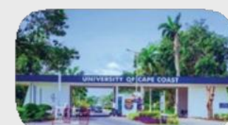
University of Cape Coast