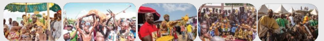
Festivals and Cultural Heritage in Ghana